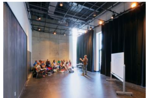
Allegheny College – Meadville, PA