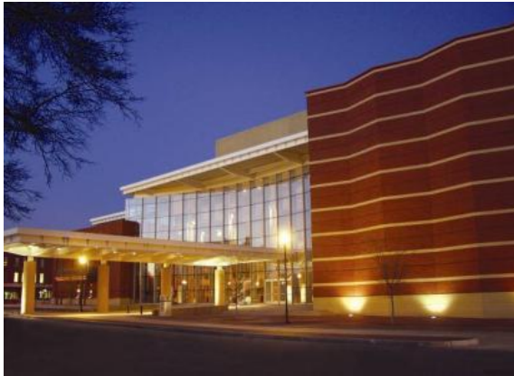
RiverCenter for the Performing Arts – Columbus, Georgia