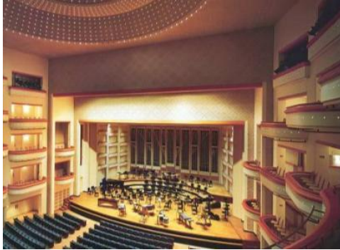
Blumenthal Performing Arts Center – Charlotte, NC