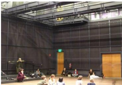
University of Notre Dame – South Bend, IN