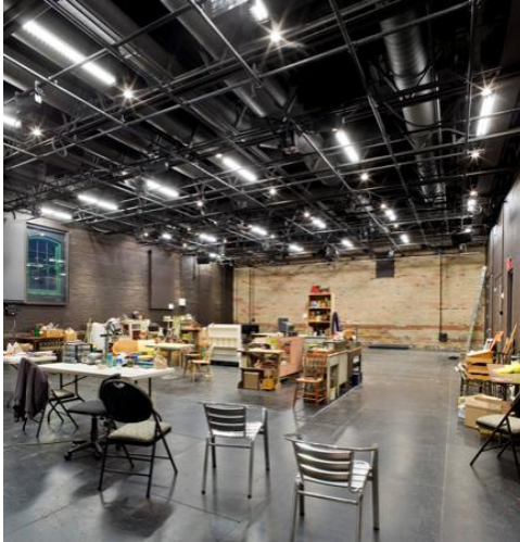
Young Centre for the Performing Arts – Toronto, Ontario

This smaller rehearsal hall will be designed to allow for rehearsals after school programs and intimate performances of approximately 75 people. It can function as an alternative community space for meetings, small lectures, parties, and events. Its smaller size will limit its ability to support larger productions.